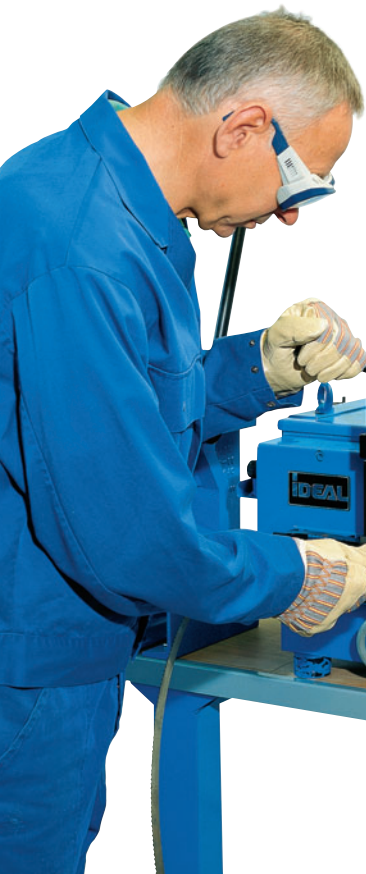
Type BAS 050

BAS 050-11 / BAS 060-11 and BAS 065-11 equipped with hydraulic clamping device (clamping of blade ends by pedal switches)